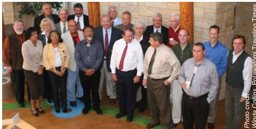
Participants in the second Cracker Barrel Conversation talked about issues such as discretionary transfer of cases and concurrent jurisdiction.

The Cracker Barrel Conversations are half-day events designed to promote local communication, collaboration and