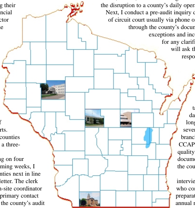
Chippewa, Lafayette, Waupaca, and Wood counties are the first to be audited.

I spend my visit interviewing key employees who contribute to the preparation of the county's annual report. The interviews allow me to document the clerk of court's report