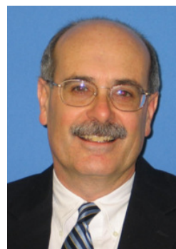
Judge Juan B. Colás