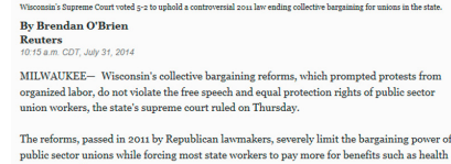
Wisconsin's Supreme Court voted 5-2 to uphold a controversial 2011 law ending collective bargaining for unions in the state.

Editorial comments and campaign statements followed. ■