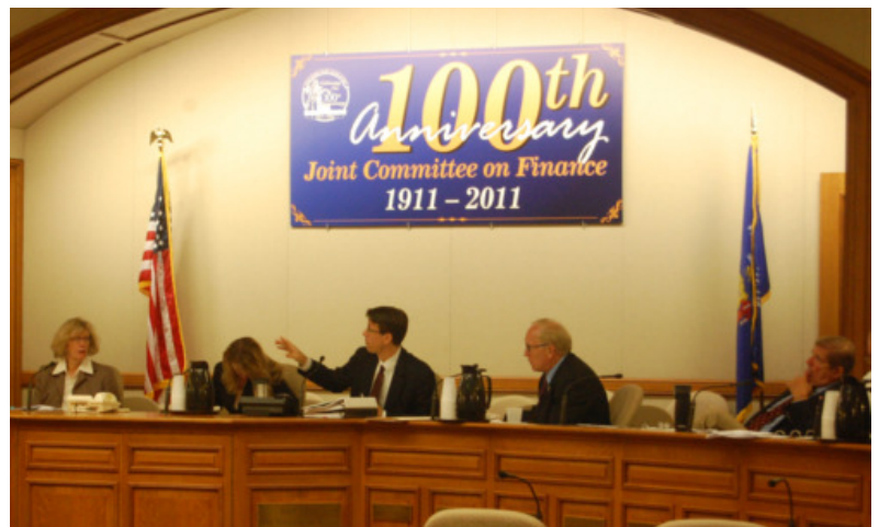
Judge Brian Blanchard , District IV Court of Appeals, helps guide discussion of issues before the criminal procedures committee of the Wisconsin Judicial Council held at the state Capitol during a meeting in August. The committee is reviewing possible changes to the state's criminal code, which was last revised in 1969. Blanchard heads the committee, consisting of judges, prosecutors, and defense attorneys, among others interested in the processing of criminal cases.