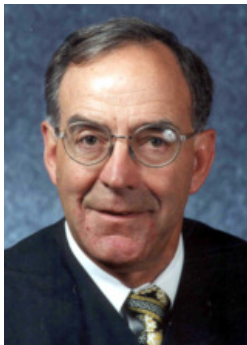
Chief Judge Donald R. Zuidmulder

many obscure misdemeanors currently in the statutes. Among the opportunities are the ability to take a global look at the current system, the chance to plot a new classification system and the possibility of identifying obsolete or obscure misdemeanors.