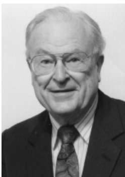
Justice Thomas E. Fairchild

the opinions, but my dad didn't demand much in the way of letters and that. There was an occasional letter. He didn't dictate a lot, although we tried to learn shorthand. But he'd write out stuff a lot. So we could get the typing done and still do a certain amount of research and checking of cases cited in briefs, and that sort of thing, and helping, to some extent, with opinions. He carried that on for a great many years. I was number three in succession."