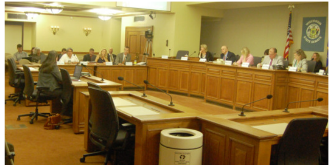
Wisconsin's problem-solving courts are among topics currently being examined by a Wisconsin Legislative Council committee. The Problem-Solving Courts, Alternatives, and Diversions committee, which met during August, is charged with studying the effectiveness, costs, and best practices of treatment courts.