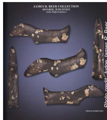
Several birdstones from Beer's collection.

Freshly plowed fields where buried artifacts had been brought to the surface had also proven to be an archeological goldmine in the past, but according to Beer, the shift to no-till agriculture has made finding artifacts more difficult. ■