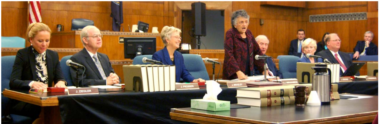
Chief Justice Shirley S. Abrahamson greets a crowd of local leaders in Sheboygan County at an opening ceremony marking the Supreme Court's historic first sitting in Sheboygan. See full story and more photos on page 13.