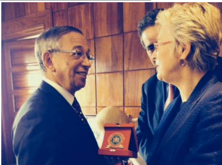
Justice Ann Walsh Bradley receives a medal from Morocco's chief justice.

Supreme Court Justice Ann Walsh Bradley recently traveled to Morocco, where she was among U.S. delegates who made presentations to judges and lawyers from the Mid East-North Africa countries (MENA). Ten delegates from each of five countries attended to learn about our court system, the rule of law, and judicial independence. The countries represented were Egypt, Tunisia, Libya, and Jordan. The North African countries are all in the midst of trying to write new constitutions or, as in the case of Morocco, having just passed a new constitution and trying to figure out how to implement the words regarding judicial reform in the new constitution. ■