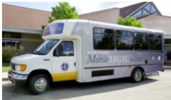
The Milwaukee Justice Center's Mobile Legal Clinic bus took its maiden voyage on Sept. 21.

According to their annual report, volunteers at the