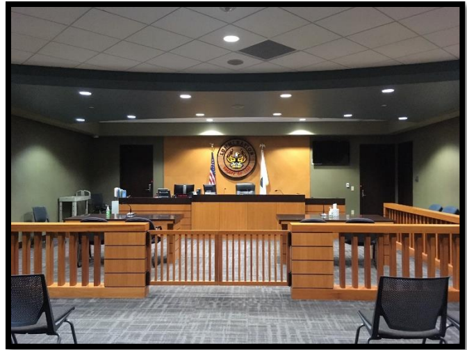
Lummi Nation Tribal Court, 2017

The first Wellness Courts were designed to serve either adult or juvenile participants in a criminal context. Later, Family Wellness Courts were developed to target parents with substance use disorders with a civil child welfare case. In a 2010 Wellness Court Needs Assessment, 7 which included twenty-eight operational Wellness Courts, respondents stated a need to work with whole families and household residents.