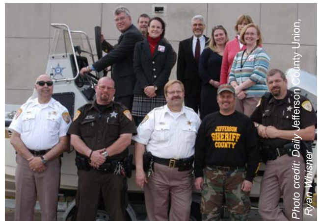
The Jefferson County Law Day Committee poses with a few of the local attorneys and Sheriff’s Department employees who helped organize one of the state’s biggest Law Day celebrations.