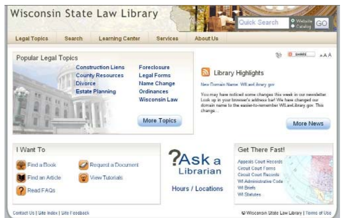
The new Web site of the State Law Library features a 'Popular Legal Topics' page

The new Web site can be found at wilawlibrary.gov .