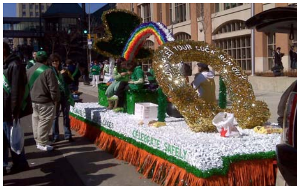
Milwaukee County Circuit Court judges outdid themselves this year with a float that captured first place in the Milwaukee St. Patrick's Day parade. The float's theme was emblazoned on a horseshoe, which reads: "Don't let your luck run out. Celebrate safely."

The float has become a tradition for the Milwaukee County Circuit Court. Each year, interested judges donate their time and money to design and build an elaborate display for the parade. ■