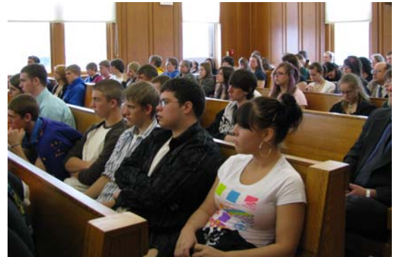
Law Day in Washburn packed the courtroom with local high school students who learned about the anatomy of a trial.