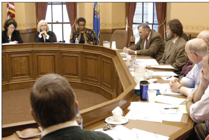
Twelve years after losing its status as a separate agency, the Wisconsin Judicial Council has been restored.