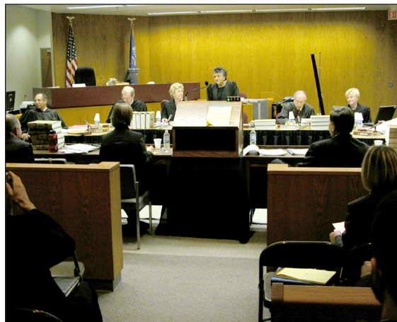
The Wisconsin Supreme Court greets a gallery full of spectators at its first-ever sitting in St. Croix County in November.